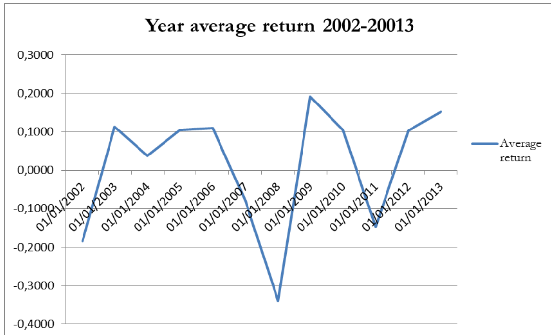
Graph 2: this graph shows the yearly average returns for the sample of funds from 2002 to 2013.

The graph 2 shows the yearly average returns of the funds' sample from 2002 to 2013. It can be easily seen that the average returns behave heavily conditioned by financial situation. The worst period for equity funds performance matches with the economic crisis that affected the whole Europe. The situation improved during 2010 then the average return decrease again and in 2012 the results were negative. The results obtained last year were the best of the last 10 years so this can mean a positive tendency for the next years.