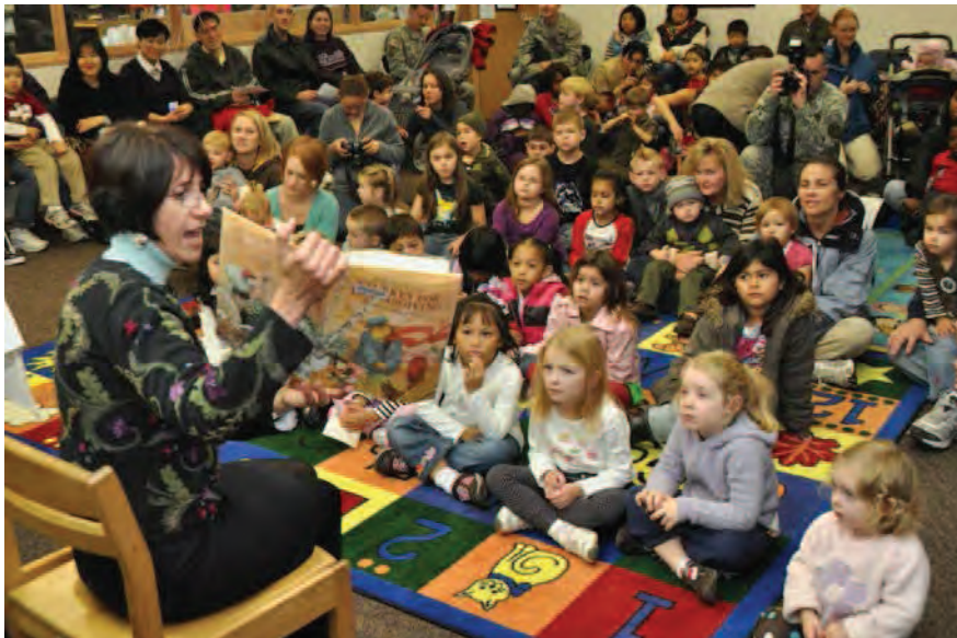
Imagen: Youngs at Library.

The same as now. Opening doors. Communicating people. Offering HUMAN VALUE to society.