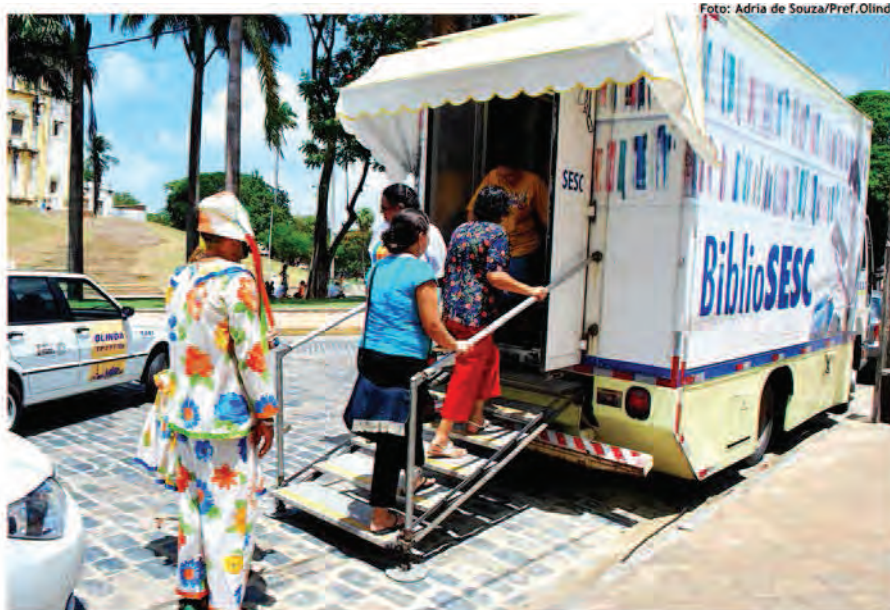
Image: Biblioteca móvel em Olinda, Pernambuco, Brasil. Flickr. Author: Prefeitura de Olinda. CC BY

Bringing books and reading close to those who face the greater difficulties in accessing them.