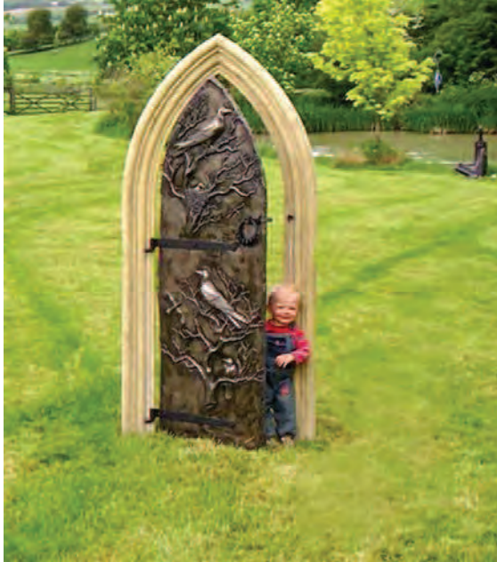
Image: Secret Garden Door. Wikimedia Author: Hannahlucy100. CC BY-SA

It can also fill our head with questions