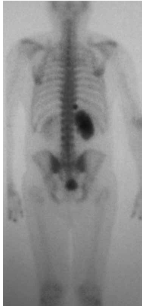
Figure 1. Technetium scintigraphy shows an increased level of activity in the region of the right kidney and over the right side of T11.

These tests were followed up with a technetium-scintigraphy scan showing increased uptake at the level of T11, on the right side, and on the right kidney (Fig. 1)