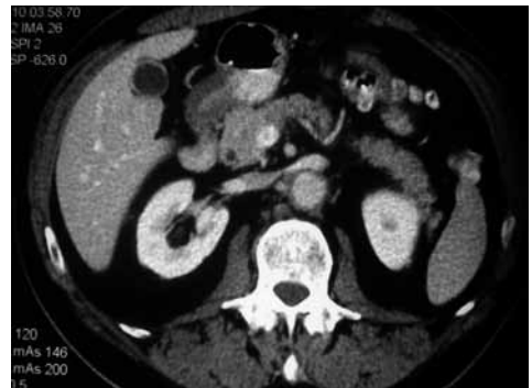
Figure 3. CT-scan image showing the fractured rib at the level of the right side of T11.