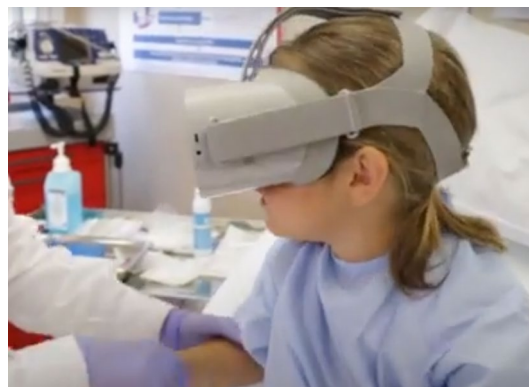
Fig. 5 One of the participants uses Oculus Go device

Participants in the other group used interactive VR, based on the same visual resource but including four simple interactive games (creating a constellation by joining stars with a laser arrow, building a dolmen by joining rocks, developing a puzzle in the desert and hunting for moles in the forest) to be played by the user with a stick or controller (Figs. 5, 6). The allocation of the participants