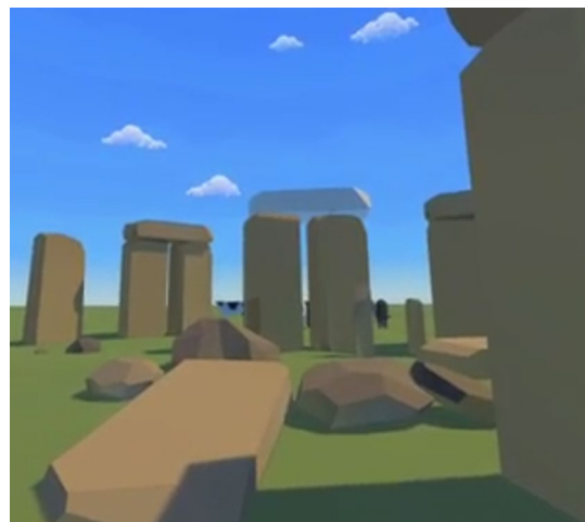
Fig. 2 Different scenes of virtual reality

combination with the use of virtual reality glasses as a distraction mechanism for the children.