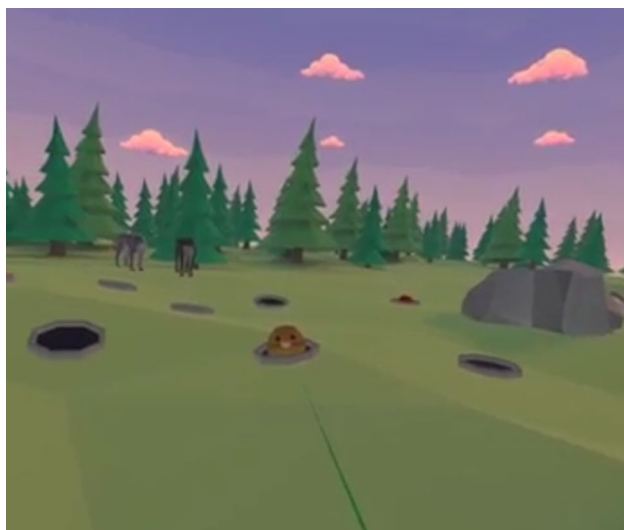
Fig. 4 Different scenes of virtual reality

environments, animals and with audio stimulation with different animals sound, with total of 3.20 minutes long and sequential repetitions (Figs. 1, 2, 3, 4).