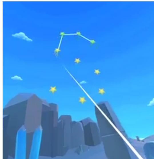
Fig. 1 Different scenes of virtual reality

In both groups, the procedure was performed following the ReVi Technique protocol, which indicated the use of a vein visualizer using ultrasound or infrared detector (at the choice of the nurse performing the procedure), in