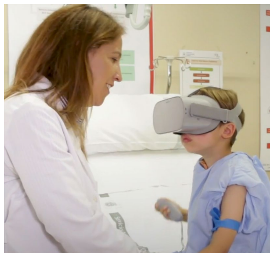
Fig. 6 One of the participants uses the stick or controller for interactive virtual reality

in the two groups was random marked sometimes conditioned by the young age of the patient and the ability to use the stick and follow-up in the game.