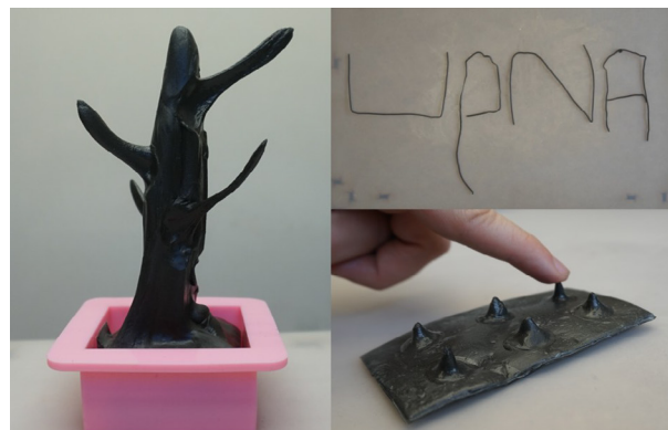
Figure 2. 3D sculpting, 2D patterning (e.g. Braille code) and 1D lettering.

This phenomenon allows a large number of applications ranging from the instantaneous formation of Braille code to the printing of different shapes in the same matrix, depending on the thermally altered area and the shape of the subsequent magnetic field applied to the material. Not only is it interesting to build a matrix with this compound, but there are also elements such as filaments and surfaces, with which you can interact in the same way as described for the matrix.