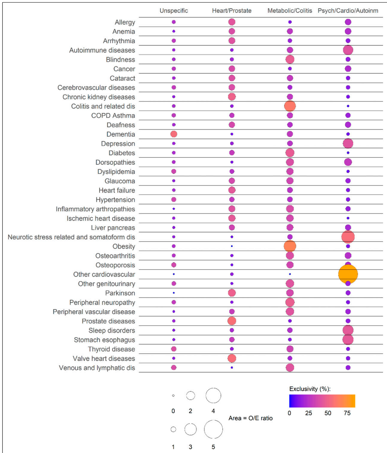
Figure 1. Observed/expected ratio and exclusivity of chronic diseases across multimorbidity patterns. Observed/expected (O/E) ratio calculated by dividing the prevalence of a chronic disease in a specific pattern by the prevalence of the same chronic disease in the entire study population. Exclusivity determined by dividing the number of individuals with a chronic disease in a specific pattern by the number of individuals with the same chronic disease in the entire study population.