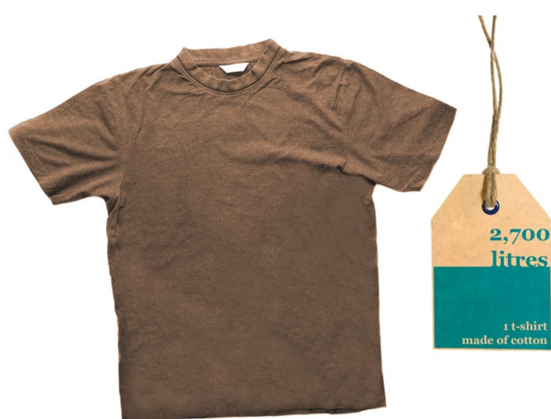
Blue water footprint of EU's cotton consumption

The water footprint is an indicator of water use that looks at both direct and indirect water use of a consumer or producer. The water footprint of an individual, community or business is defined as the total volume of freshwater that is used to produce the goods and services consumed by the individual or community or produced by the business.