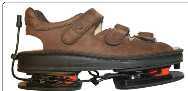
Figure 1 Instrumented shoes. Instrumented Shoes (right shoe). Each Force Shoe (left and right) has 2 sensors modules: one under the forefoot and one under the heel. A sensor module includes a Force/Torque Sensor and a Motion Tracker.

Time parameters include the stance time ( t_{\text{stance}} ), defined as the % of cycle that the reference limb is in contact with the floor and the midstance time. In addition, the average vertical Ground Reaction Force (vGRF) for each involved and uninvolved leg was evaluated during the stance time ( A_{\text{vGRF,w}} ) normalized by body weight (%BW).