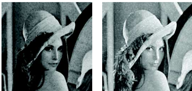
Interval-valued image B