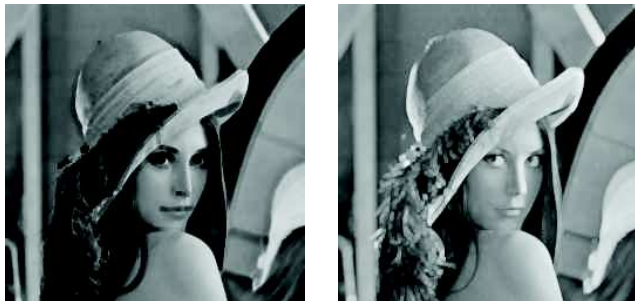
Interval-valued image A