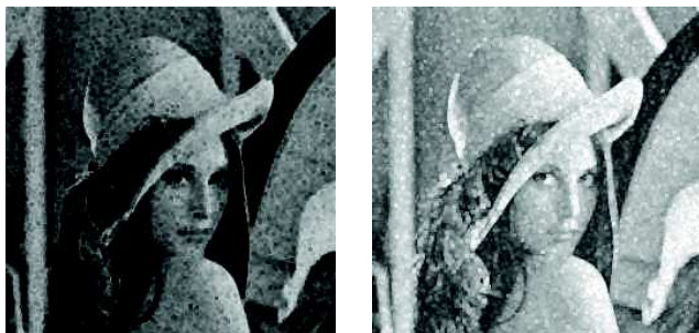
Interval-valued image C