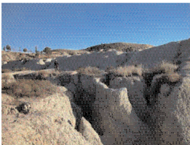
Fig. 2. Gully generated by piping in an abandoned terraced plot.

The measurements made show the existing relation between the depth of pipes and the height between agriculture terraces. The development of pipes is so that the pipes may connect two consecutive agriculture terraces, with a length over 8 metres (Figure 2). It should be mentioned how the importance of the hydraulic gradient like one of the generating causes of pipes, since it has already been done by many other authors.