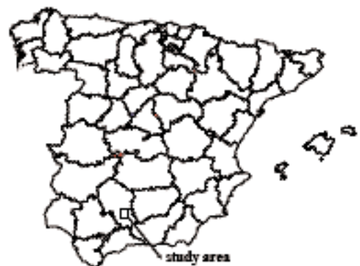
Fig. 1. Location of the study area within Spain.

The goodness of fit of the sediment transport relationship described above was computed using field data from an olive orchard near Baena in Andalusia, Spain, (Fig. 1). In a hillslope of 6600 m 2 under olive plantation, draining towards a large, permanent gully, detailed map was prepared of linear incisions. Total station was used to measure local topography and eroded volumes were measured with tape measures.