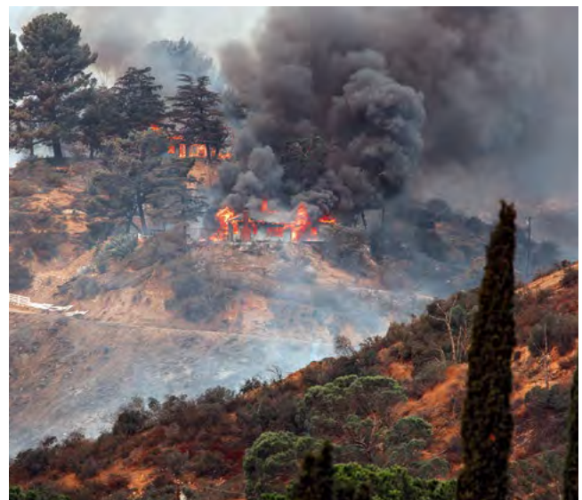
La Tuna wildfire in Los Angeles, CA in 2017

In the immediate aftermath of wildfires, the burnt soil is bare and dark, and highly susceptible to erosion,