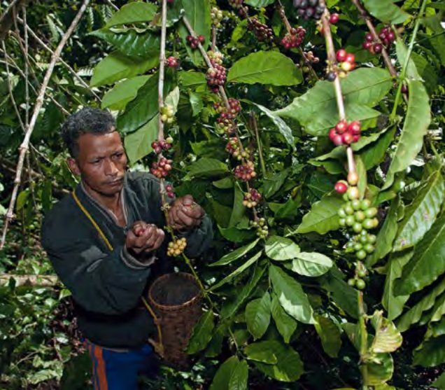
Coffee is a commodity of the Wae Rebo people in East Nusa Tenggara, Indonesia. Their coffee plants are directly adjacent to natural forests