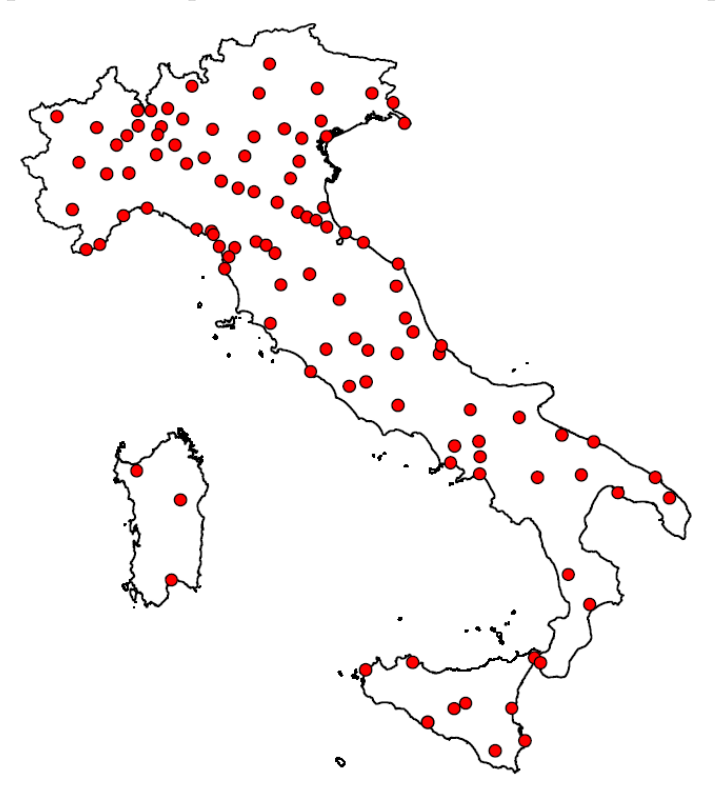
\mathbf{Appendix}\ \mathbf{A}:\ \mathbf{Spatial}\ \mathrm{distribution}\ \mathrm{of}\ \mathrm{cities}\ \mathrm{in}\ \mathrm{our}\ \mathrm{sample}