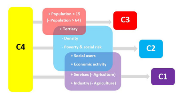
Fig. 3: Summary of determinant factors for improving PA levels.

Second, we have explored the main regional socioeconomic characteristics that explain the differences among the groups of regions. Regional economic variables such as GDPpc, economy activity, economic structure of sectors, tertiary education and social Internet use are significant variables for classifying European regions according to the health-related PA levels, showing that the profile of the unhealthy regions (Cluster C4) statistically differs from the rest of the clusters. Previous studies have emphasized the relevance of regional economic variables (Kokolakakis et al., 2017; Wicker and Downward, 2017), but no previous evidence has been obtained about the role played by other economic variables such as the relevance of the different sectors of the economy and poverty. The influence of regional social Internet use on PA levels deserves special attention. Its influence could be related to the fact that part of the social use of the Internet is closely associated with sports news, and through social networks, people could be inspired to become involved in sport and PA.